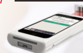
Released 1st AsReader device