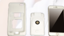
3rd Gen modular AsReader & RAIN UHF RFID