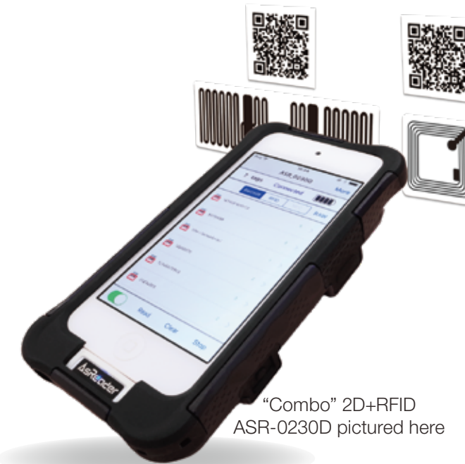
"Combo" 2D+RFID ASR-0230D pictured here