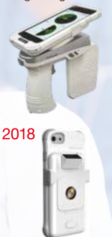
RAIN UHF RFID 10m (32 ft) Long-Range Guns